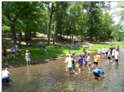
Macro Invertebrates Session