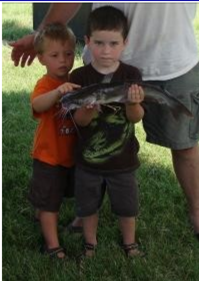
Cross County CD hosted a Hooked on Fishing Derby