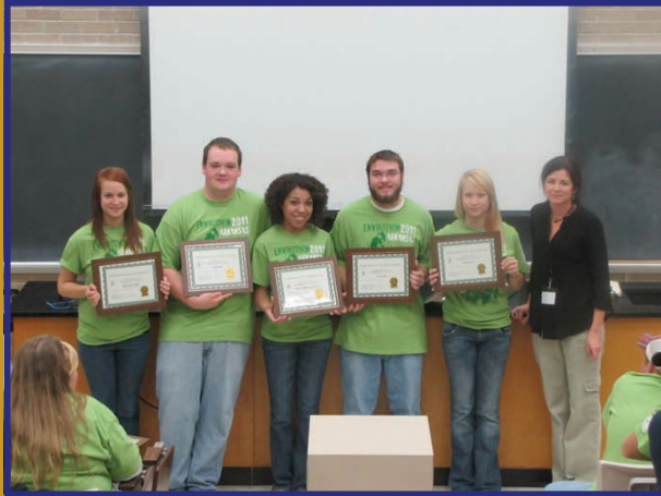
First Place—Mills High School Pulaski County