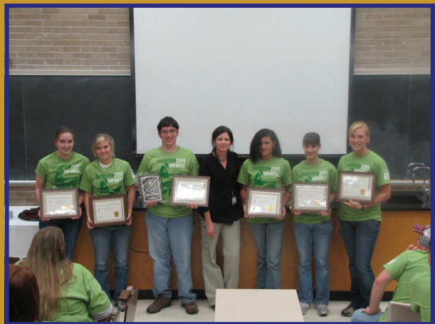
Second Place—Mtn. View High School Stone County