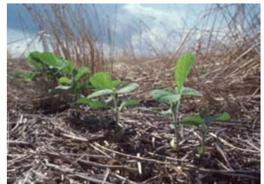
Scientists: zero tolerance target for resistant pigweed