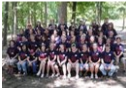
2010 YCW Students & Staff

as water quality, nutrient management, soil erosion, wildlife habitat, chainsaw safety, and much, much more.