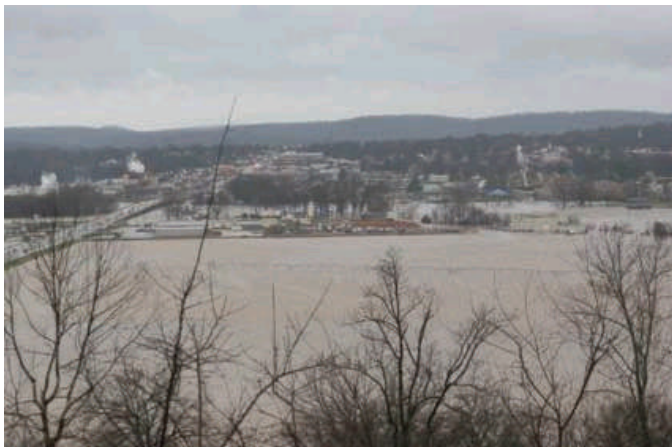
Overlooking Batesville, Arkansas during recent floods

Recent flooding throughout much of the state has drawn attention to the fact that many of our watershed dams have or will soon be reaching their recommended life span. This situation will require an investment from local, state and federal agencies to ensure the health, welfare and safety of the people of Arkansas.